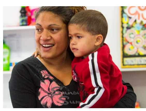
Families at the Centre research project