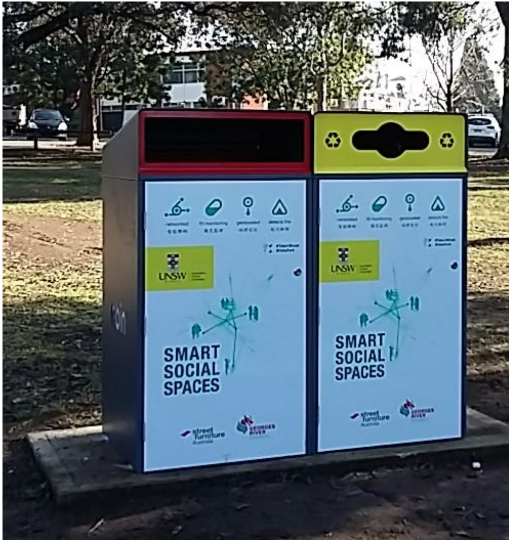
Georges Rives Council smart bins