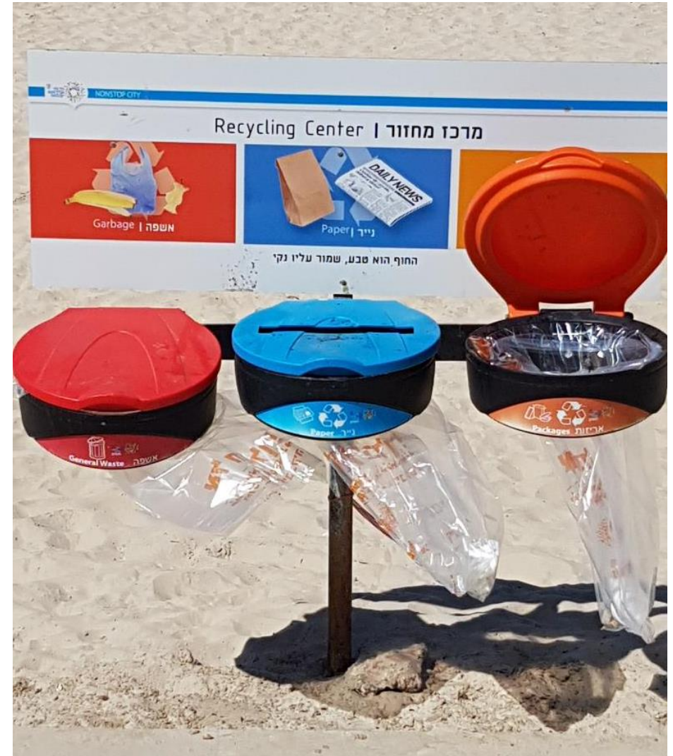
Tel Aviv Municipality smart bins